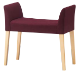
RESTF [レストフ] ▶P238